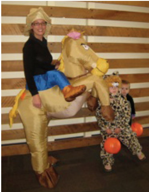
Have you ever seen a “Mama Cowboy” keeping a leopard and munchkin in tow?

To avoid tricks, Friends were busy Halloween afternoon and evening handing out treats to costumed kids (and some adults) by the “corral.” Here are just a few of the visitors.