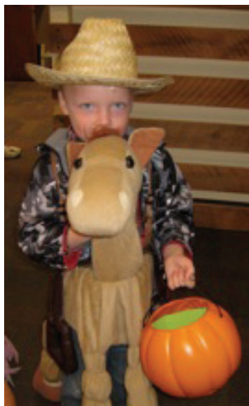
Many-a-trickster rode a horse this year.

After some beginning challenges, FVRL cardholders can now download up to three MP3-format music files each week. The files are downloaded to the patron’s home computers or devices via a service called Freegal. Explore thousands of songs from the Sony Music Entertainment catalog at http://www.fvrl.org/findabook/index.cfm . Entertainment catalog. There is FAQ section to help answer questions.