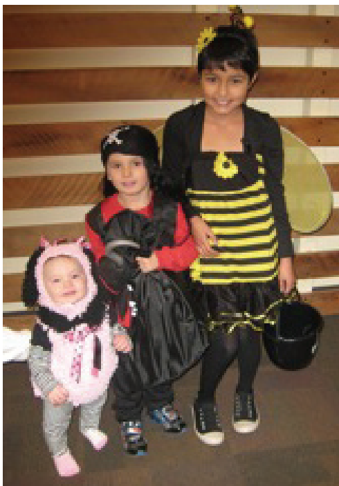
Here’s an imaginative trio.