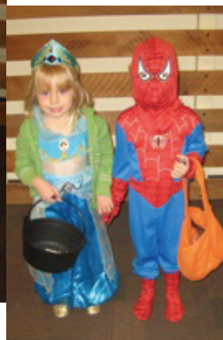
There were many unlikely playmates who showed up.

Bats appeared out of nowhere. This one even carried a black pumpkin to hold his or her collection of treats. Was this a hint for black licorice?